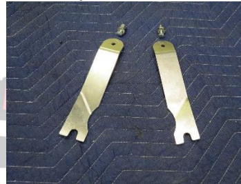
Front Bumper Valance Brackets